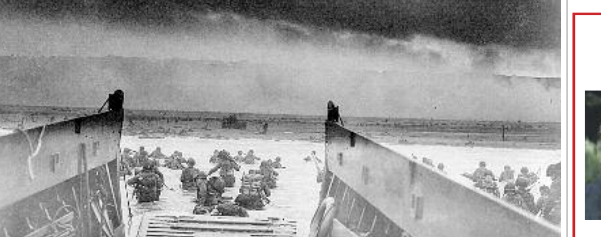
Taxis to Hell and Back: American soldiers head from a Coast Guard landing barge toward the Normandy beach on D-Day, June 6, 1944.